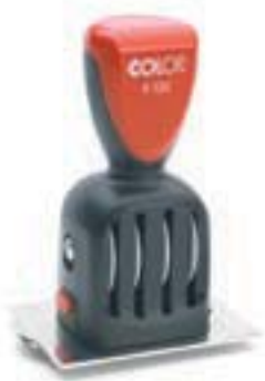
P 700/10 25 x 55 mm